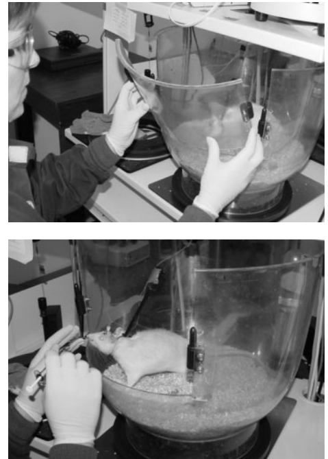
F2. New bowl cage with access panel. Top: removing panel. Bottom: preparing for PO dose.