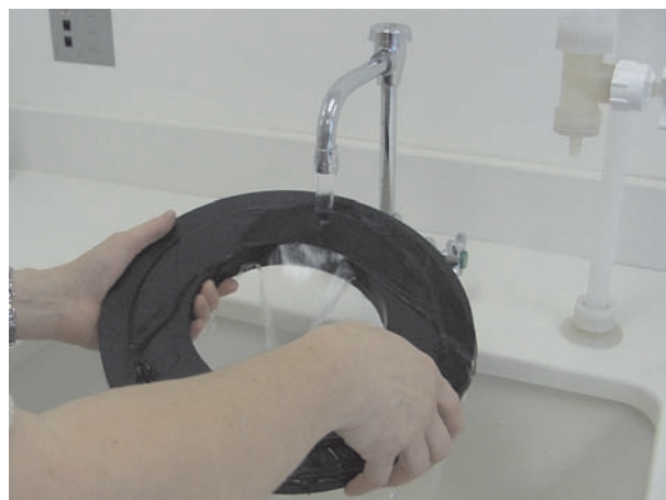
Wash Turntable in Sink