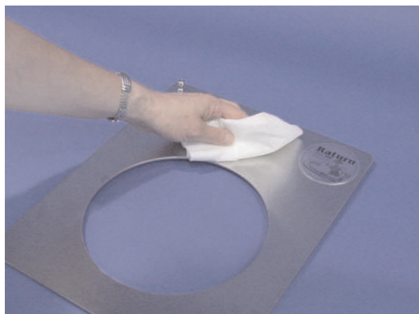
Wipe or Wash Base Plate