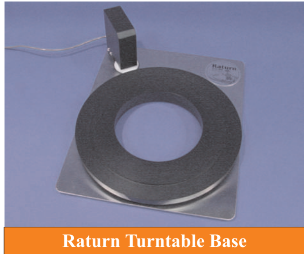
Raturn Turntable Base