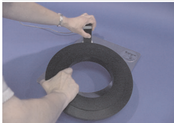
Lift and Remove Turntable